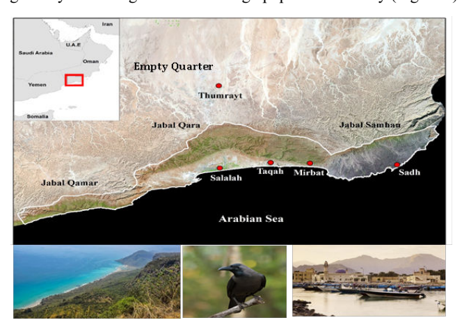
Figure 2: A map illustrating the Dhofar portion of the South Oman along mountain forest ranges (Green with brown regions). The Inset box figure (Red box) illustrates Dhofar's location relative to the Arabian Peninsula. Images below depict forest mountain ranges in Dhofar (Left), House Crow (Center), and Mirbat fish village (Right).

The study area encompasses the southern part of Oman within the Dhofar Governorate (Figure 2). It is bordered to the southeast by the Arabian Sea, to the south by the Republic of Yemen, and to the northwest by the Empty Quarter desert (Figure 2). Salalah, is the largest city in this region and has a high population density (Figure 2).