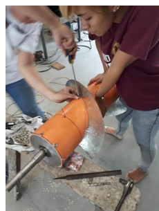
Figure 4. Fastening of blade to the PVC pipe.