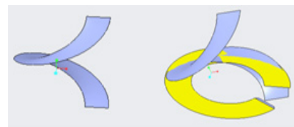
Figure 2. CAD Blade design