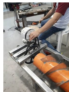
Figure 5. Turbine-generator assembly.