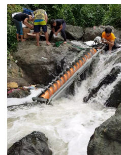
Figure 6: Actual testing process of the Archimedes Screw Turbine