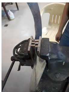
Figure 3. Forming of blade into its desired pitch.